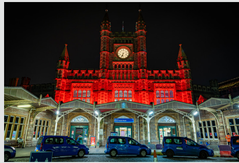
Bristol Temple Meads and Ashton Gate Stadium Turned Red.

Media Coverage: Bristol Live, Sam FM, Bristol 24/7, BCFM, ShoutOut Radio, The Chris & Caz Show, Glitterbeam Radio, Greatest Hits Radio Pride, Mayor's Blog Takeover, Up Our Street Magazine.